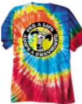
Med. Get a Life T-Shirt $25.00