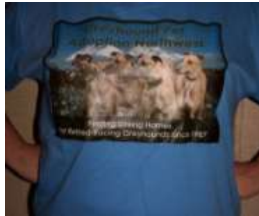
Lg. GPANW T-Shirt $20.00