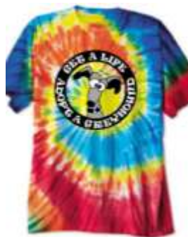
Lg. Get a Life T-Shirt $25.00