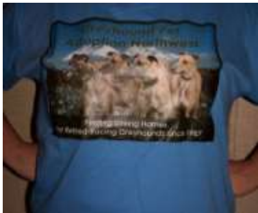
Med. GPANW T-Shirt $20.00

It's nearly Spring and time to start thinking about walking your Greyhound and going places together. Here are some great items to refresh your Greyhounds look and comfort.