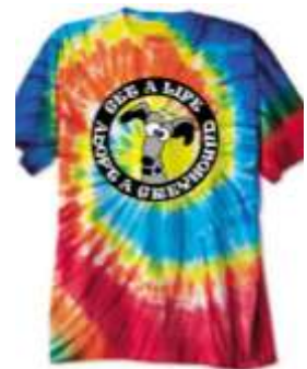
XL Get a Life T-Shirt $25.00