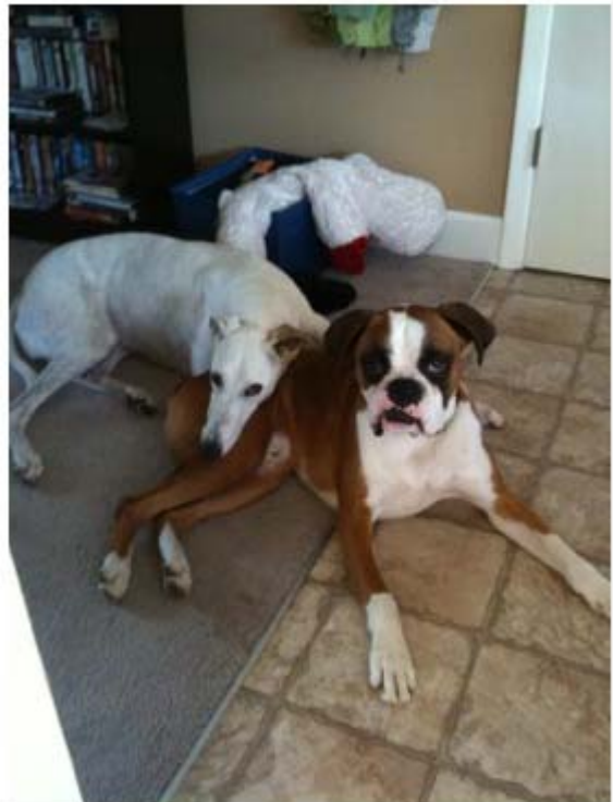
Greyhound Kobe DiMeglio, age 4, with Boxer Rusty DiMeglio, age 2. Happy hounds in happy homes.

We like photos of Greyhounds with other dogs, other animals or toys. Funny and goofy poses are great and anything that shows the dogs personality.