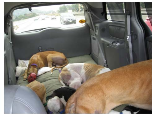
The van is just another bed!