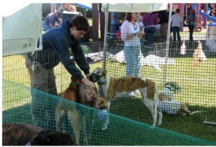
The offleash area was fun for everyone!