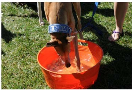
Bobbing for hotdogs!